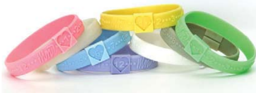
Pink, Glow N Dark, Baby Blue, Sunflower, Lavender, White, Gray, and Mint