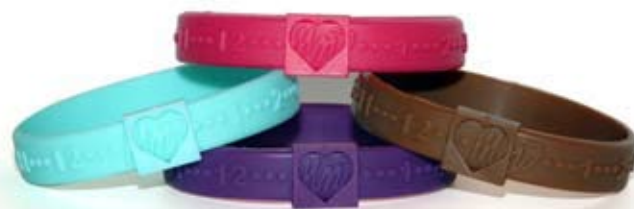
NEW Colors: Teal, Cherry Pop, Plum and Chocolate